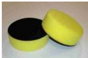
6" Foam Polishing Bonnet, 2" thick