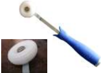
3/8" Corner Compaction Roller