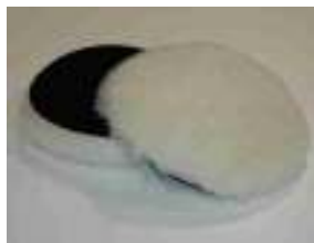
6" Sheepskin Polishing Bonnet