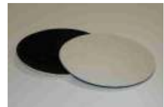
6" Hard Felt Polishing Pad